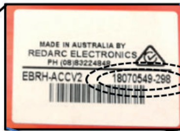
Image 2 - Main Unit